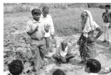
Field-testing and the Guidance to Farmers by DISA

directly benefiting the village communities who find it difficult to carry on with agriculture due to various difficulties they face and make it viable and economic. The Programme is being implemented under the guidance and network of CSOs — ENABLERS under the leadership of Grameen Development Services, Lucknow and is supported by Sir Dorabji Tata Trust, Mumbai. We could develop the Package of Practices after the field-testing and extend the programme to 415 farmers spread in 28 villages and facilitate the formation of 10 Farmers' Clubs and their Federation. They have developed Common Facility Centres for supporting the members of the Farmers' Clubs. We also could arrange for their exposure visits, introduction of compost manure preparation, mushroom