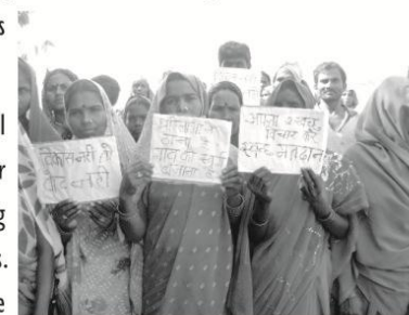
NAYI DISA MAHILA SAMITI fighting for their basic amenities

They had various cultural programmes. All these celebrations could instill greater confidence in them by associating themselves with the Groups and CSOs. Many men and children also attended the programme and the celebrations created