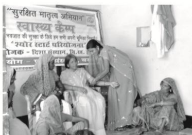
The activity of pre-natal, post-natal care of pregnant women