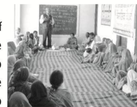
Members taking part in Group Meetings

Awareness, participation and signs of change have been the flow of sequence and the strategy of social animation and are the means to build Social Capital for the marginalized sections. We have used PRA, SWOT Analysis, Focus Group Discussions, one-to-one discussions, Group Meetings;