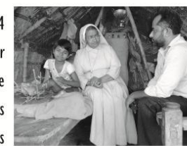
SLF National Coordinator field visit

DISA is involved in the rehabilitation of 64 Differently Abled children by adopting them for integrated development for which Stitching Lilliane Foundation has extended support through Jan Vikas Samiti, Varanasi. We follow the principles and practices of Community Based Rehabilitation (CBR) model. The