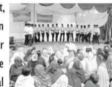
Students of Jyoti Gurukul in Street Play

In Sadar and Harraiya Blocks in Basti District, Ikauna Block of Shrawasti District, and Mithaval Block in Siddharthnagar District, DISA has involvement for integrated community development programmes. In these villages Self Help Groups have been functioning for social and financial inclusion. The Group Leaders are taking