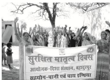
The RALLY of Safe Motherhood by Mother Groups

Sansthan, under SURE START programme. In Level -I, we cover the whole block, in level-2 we reach out to 40 % of the block and take up intensive interventions and in level-3 in 15 % of the block. System Strengthening in collaboration with PHC, Block, ICDS, Panchayats and the Govt. machinery has been the hallmark of this programme. We could make substantial progress in this field. The monthly meetings of the VHSC and Mother Groups are very regular and active in Both Bahadurpur and Harraiya Blocks. There are efforts for system strengthening and greater collaboration with the Govt. Various innovative programmes are introduced for the capacity building of ASHAs and awards