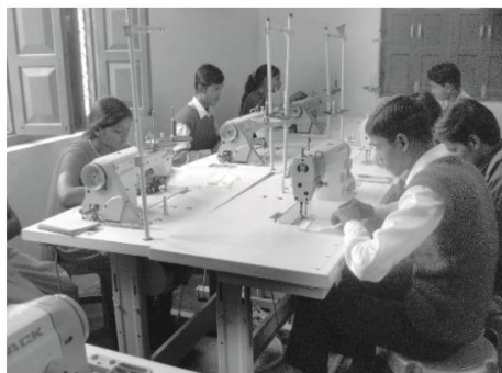
SEAM Programme training to BPL Family personal

an intensive theory cum practical training in which the learners had the opportunity to learn tailoring, cutting and stitching, and these were taught and facilitated their placement in apparel manufacturing companies for employment. Till March we have trained a total - 213 learners.