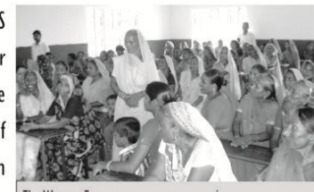
The Women Empowerment programme is on progress....

DISA is partner with PGSS (Purvanchal Gramin Seva Samiti) Gorakhpur for the implementation of IDEA Programme at Harraiya with the financial support of Caritas India, New Delhi. Integration with the development actors at local level, collaboration with CSO partners, various Departments and Commissions, Organization