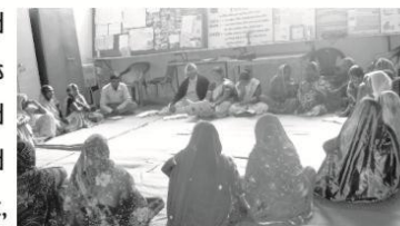
Block Level Meeting at Harraiya

This programme has been initiated in April 2007 with 415 marginalized farmers in selected villages of Mithaval Block and the programme intended to promote good package of practices for safe, scientific, profitable and sustainable agriculture. It is