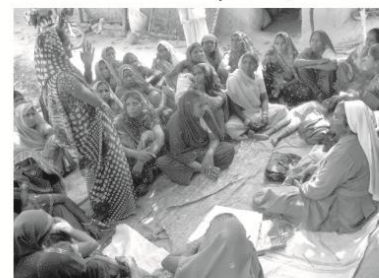
The Interaction session of IDEA programme