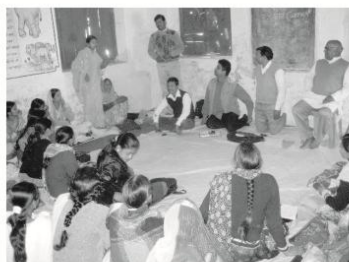
POWER WITHIN Programme : Monthly meeting

In this intervention DISA has entered into collaboration and partnership with CARE India and intervened in 83 selected model schools in Ten Blocks of Bahraich and Balrampur Districts to implement the Girls' Leadership Initiative - Power Within Programme by which the empowerment of girls through education is aimed at. DISA is