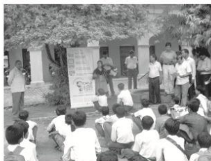
Awareness programme by CHILDLINE

Considering the involvement with children in difficult situations — the abandoned, truants, the orphans, the children on streets, laboring children, DISA has been the Nodal Organization for the city coordination activities of CHILDLINE, Gorakhpur, which we started effectively from January 2006. We joined hands with PGSS,