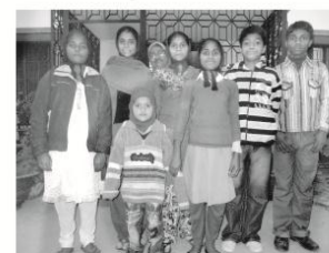
SLF children in Special School at Lucknow

children adopted are given medical, educational, social and emotional support to cope with their disabilities and integrate themselves in the mainstream of the society. 10 children are in the Special Schools in Lucknow and Jeevan Dhara, Kasia. 02 children have been helped for corrective surgery of their bowlegs.