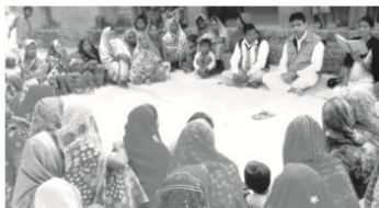
Community Based Organization Meeting

We focused our attention to increase the awareness of the communities in the affairs of Panchayati Raj Systems. In the villages the participation of people especially the