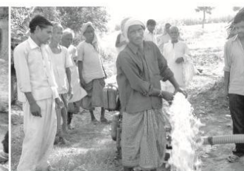
Providing Technical assistance to Farmers