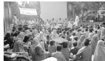
NAYI DISA MAHILA SAMITI Gathering

GPs with 425 members (total 1125 members) for empowerment of women and gender balance in the society. Besides the village level formation of the Association of Women, there are the Block Level and DISA Central Level Federation. In Mithaval Block, we have