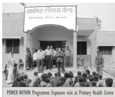
POWER WITHIN Programme: Exposure visit at Primary Health Centre

began implementation of the programme in the selected 83 villages / Primary Schools in Ten Blocks of Bahraich and Balrampur Districts. The Programme implementation started in July 2009 and completed in May 2011.