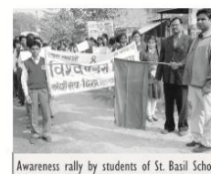
Awareness rally by students of St. Basil School

village visits and mass communication media like street plays and puppetry etc as tools to create awareness in the communities. The Students of St. Basil's School and Jyoti Gurukul continued to extend their support for the reach out and awareness programmes in villages.