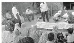
DISA Team inspects the Livelihood programmes

We have a total of 160 SHGs functioning in 82 Gram Panchayats of 140 villages. We have financial support from NABARD to facilitate 50 Self Help Groups. All the 50 Groups are formed and linked with Banks by opening their Savings Accounts. Groups initiated inter-lending among the members and they are in the processes of CCL with Banks.