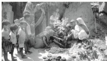
Participation of Women in plantation drive

great effect in villages. The themes for this year were Safe Motherhood, Accessibility to Govt. Schemes and Increasing the Participation of Women in Panchayats.