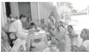
DISA worker facilitates the functioning of Self-Help Groups

strenuous steps to make the Groups active, skillful and involved in various collective actions for empowerment. DISA Team of social workers accompanies and facilitates the management of the Groups.