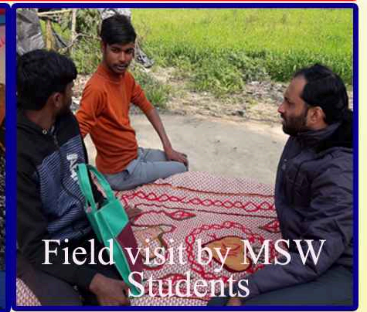
Field visit by MSW Students