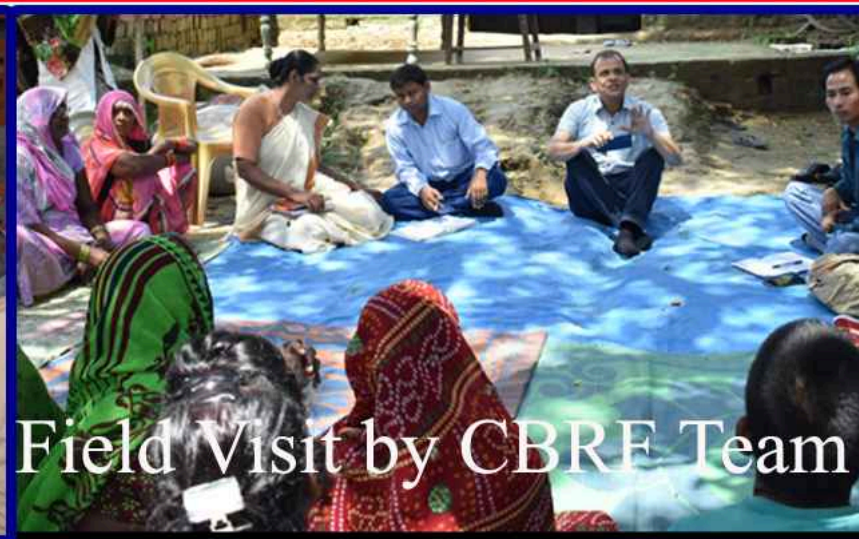
Field Visit by CBRE Team