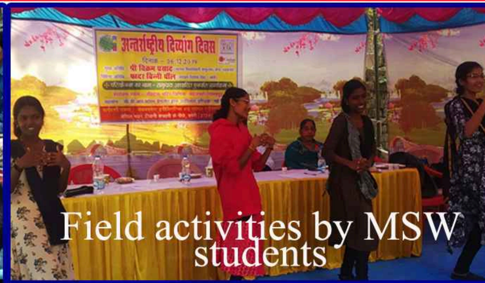
Field activities by MSW students