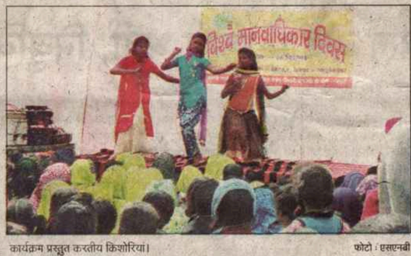
कार्यक्रम प्रस्तुत करतीय किशोरियां।

डिडई (एसएनबी)। क्षेत्र के ग्राम असनार में दिशा संस्था द्वारा विश्व मानवाधिकार दिवस के उपलक्ष्य में कार्यक्रम का आयोजन किया गया। कार्यक्रम में असनार, इमिलिया और करही मंड के सैकड़ों लोगों ने प्रतिभाग किया।