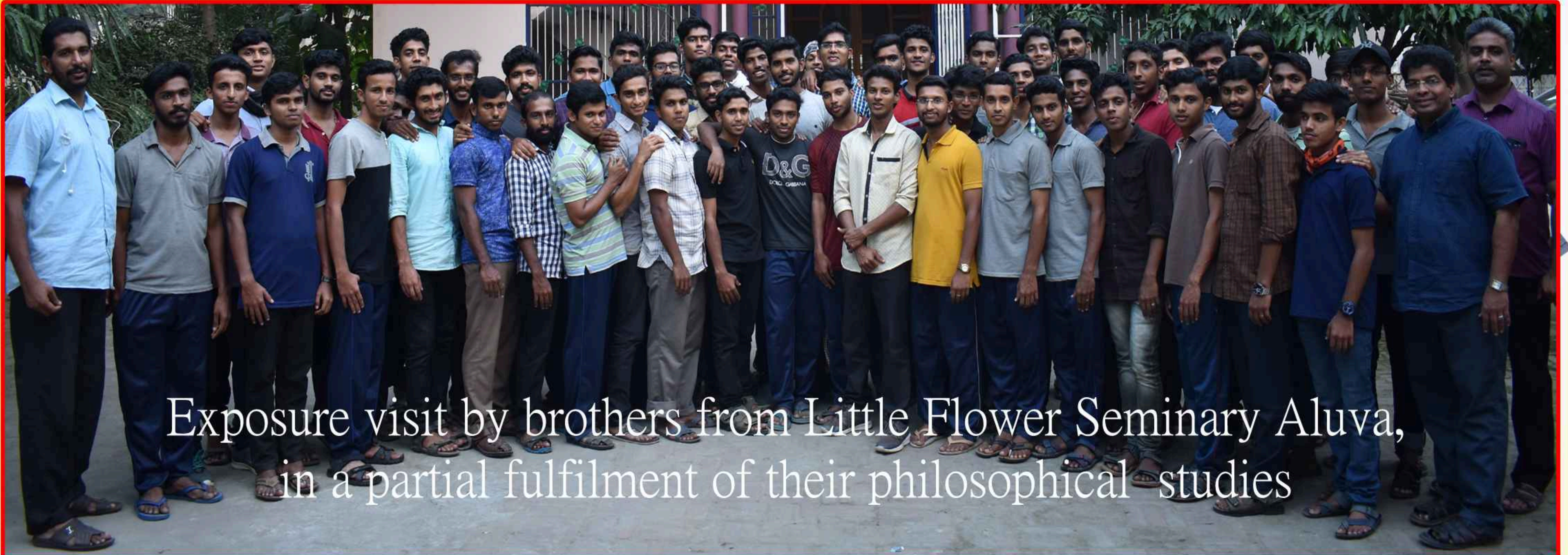
Exposure visit by brothers from Little Flower Seminary Aluva, in a partial fulfilment of their philosophical studies